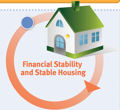
Financial Stability and Stable Housing

140,000 received assistance with emergency basic needs through United Way.